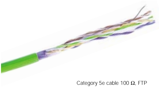
Category 5e cable 100 Ω, FTP

Part of the 3M™ Volition™ Network Solutions, this 250 MHz FTP cable is a Category 5e TIA / EIA 568 and ISO 11801 and EN 50173 Class D compliant.